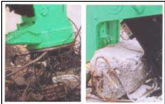
Strong magnet !

Simultaneous operation of pulverizing and magnet is possible.