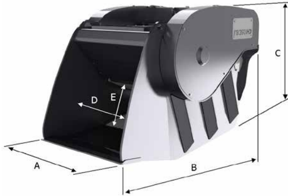
INTERCHANGEABLE IRON SEPARATOR KIT